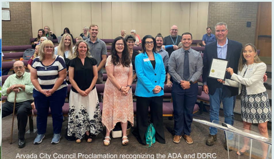
Arvada City Council Proclamation recognizing the ADA and DDRC